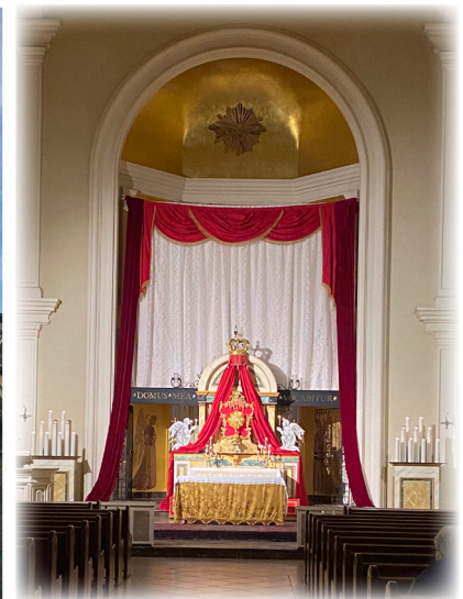
Forty Hours at the Toronto Oratory and St. Philip's Seminary