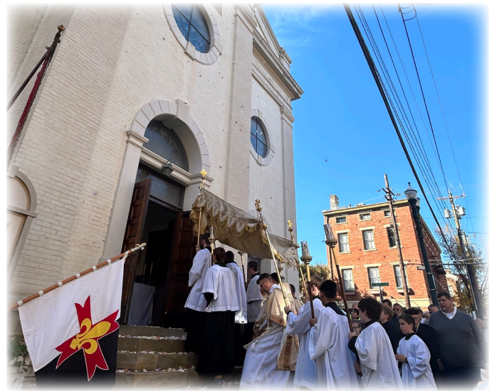
Rose Petals fall on the Canopy as the Blessed Sacrament enters Old St. Mary's following the Men's Eucharistic Procession