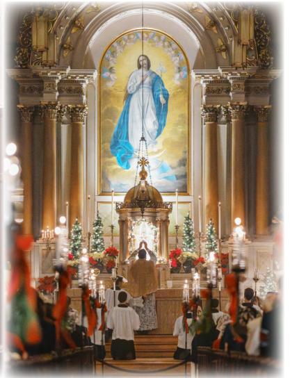
Christmas Mass 2023