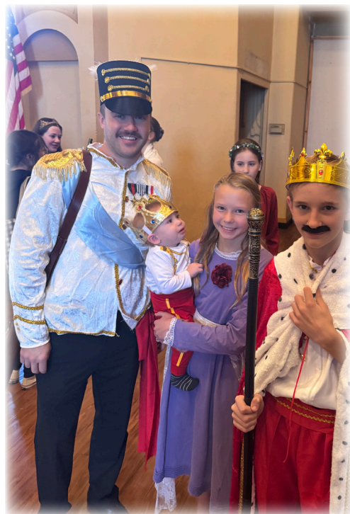
The Blessed Karls and Zita at the All Saints' Day costume party 2024