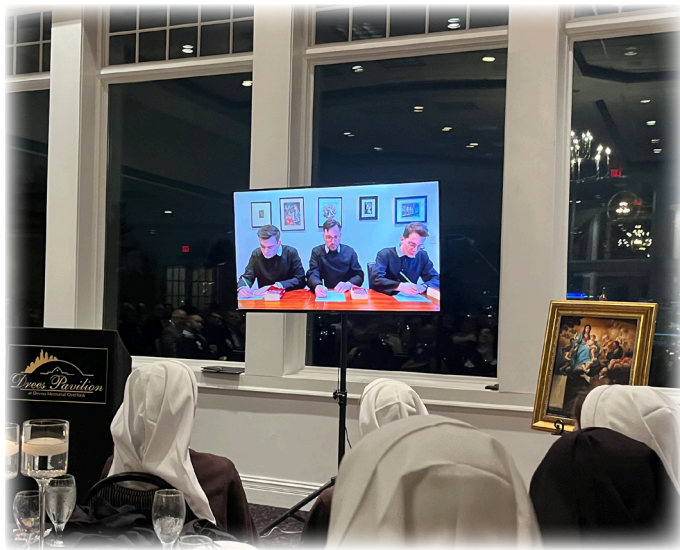
The Brothers' Video at the Oratory Gala