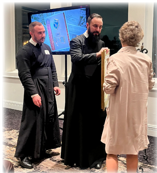
Presenting the St. Philip Neri Award at the Gala