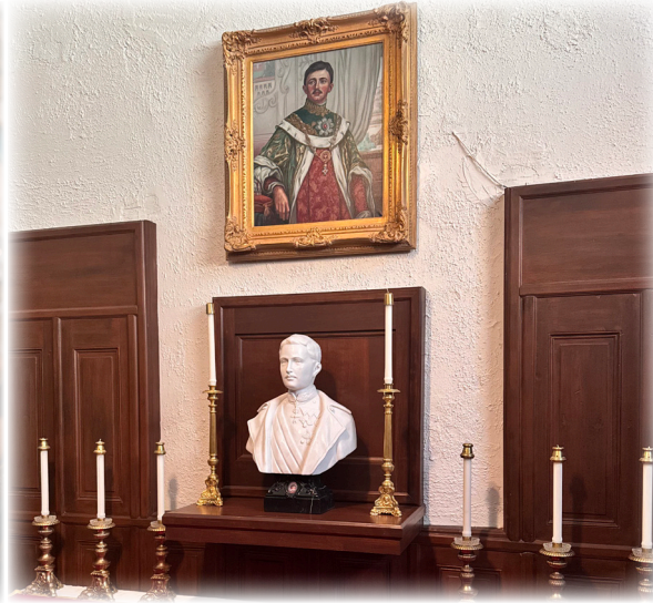
The Bl. Karl of Austria Shrine